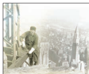
Unique archive materials recovery