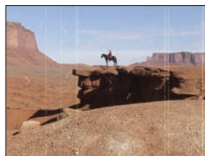
Old movie picture enhancement and retouching